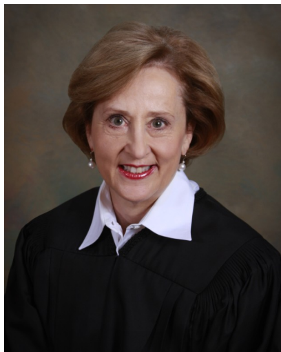
Judge Elizabeth Erny Foote

Hon. Elizabeth Erny Foote serves as a United States District Court judge with her duty seat in Shreveport.